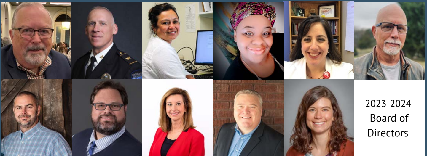
2023-2024 Board of Directors

Anticipating client needs. Thinking outside the box. A non-profit's work exceeds expectations when leaders and staff feel empowered and supported to become innovators and change-makers. It's one of the many things I am so proud of here at Safelight. This past year, we added new pet kennels to our shelter, giving survivors the ability to bring their beloved pets with them when leaving their abusive environment. In the past three years, Safelight has doubled our budget, allowing our team to provide more and more crucial services as needs increase. Thanks to our amazing staff, board, partners and volunteers, we continue to create hope, heal lives and change our community for the better.